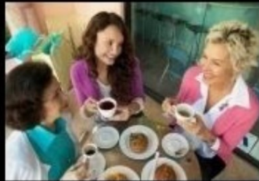
What my husband thinks I do