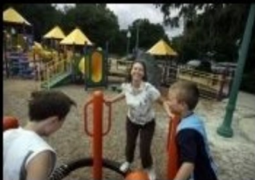
What my kids think I do