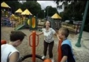
What my kids think I do