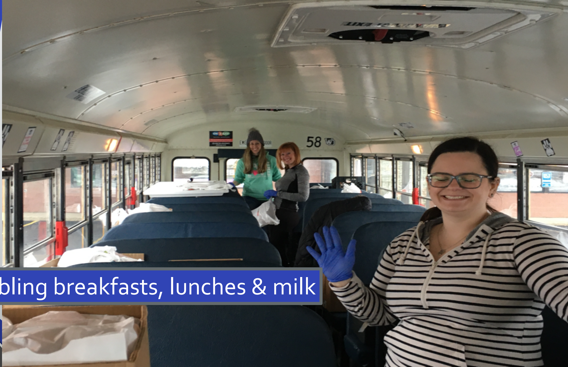
Assembling breakfasts, lunches & milk