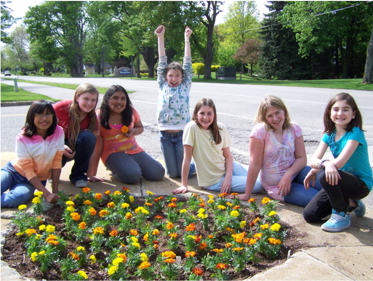
Special thanks to Jack's Greenhouse for helping Cadet Troop #2533 plant all these beautiful marigolds in the circle at the edge of the school front parking lot! They look great!!!